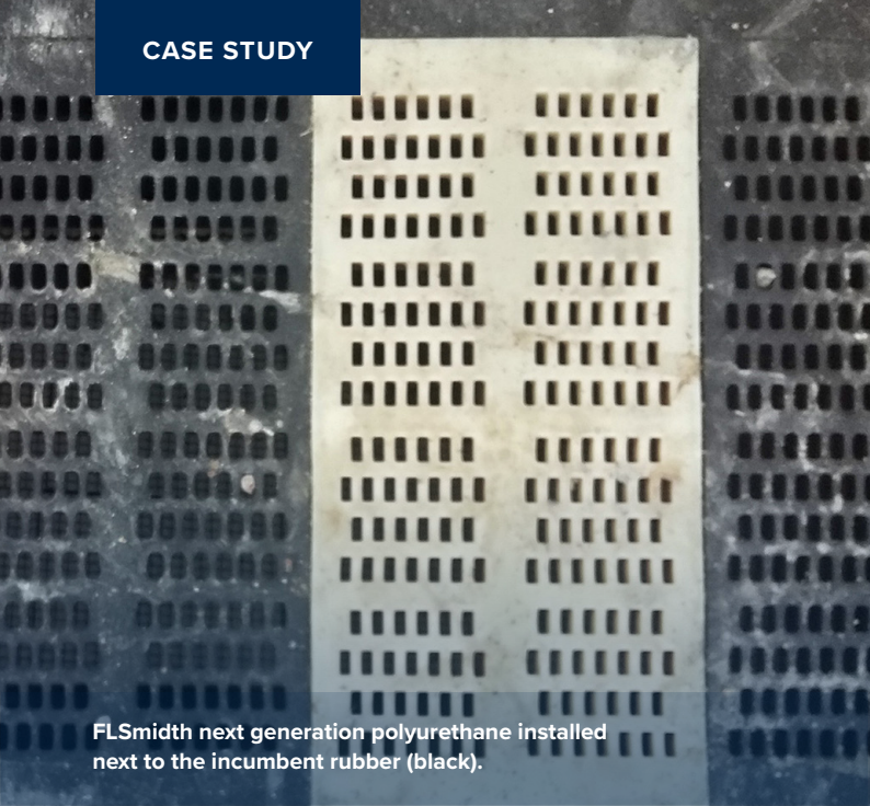
FLSmidth next generation polyurethane installed next to the incumbent rubber (black).